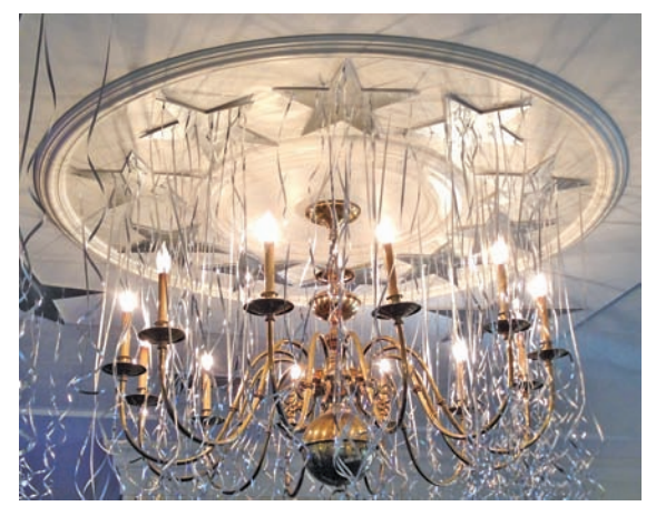
Silver stars and streamers decorated the ceilings.