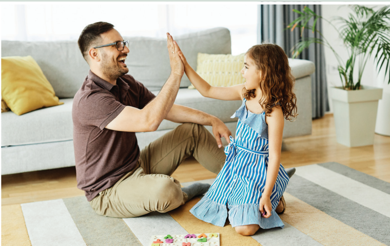
The goal of the MPC is to strengthen the relationship between parent and child.