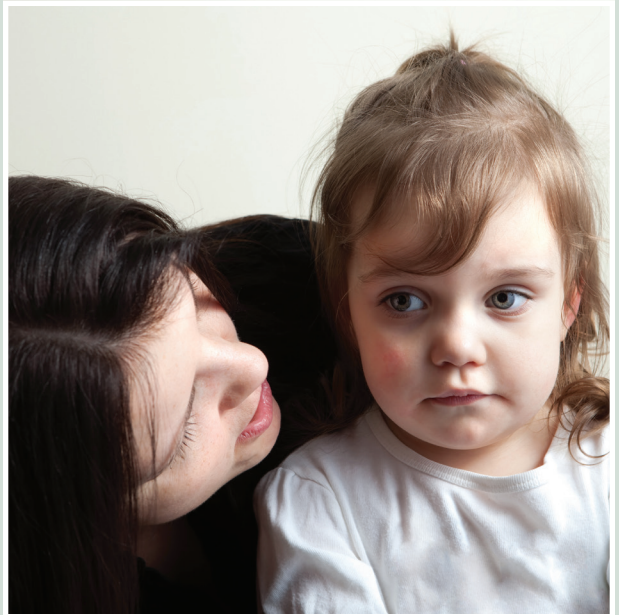
Healthy attachments between parent and child are nurtured during coaching visits.