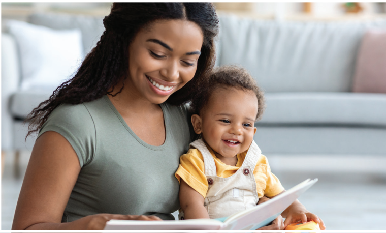
Parents are developing the necessary skills to safely and lovingly care for their children.