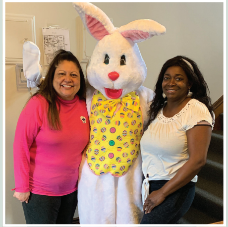
Culturally sensitive staff form connections with parents and their children.