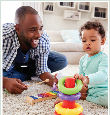
The Center is warm and welcoming and resembles a home-like environment.